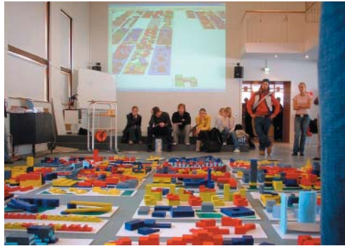
Fig. 04 and 05: Student workshop. Left: Programmatic parameter model and projected computer model. Right: Formal parameter model with spatial coordination across individual blocks.